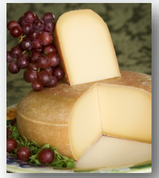
PLEASANT RIDGE RESERVE