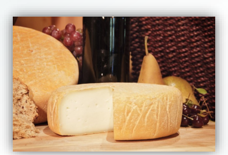
CABRA LA MANCHA