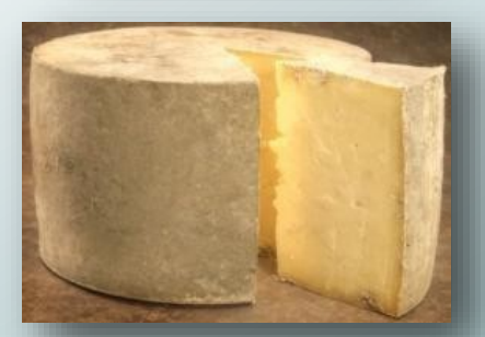
BANDAGE WRAPPED CHEDDAR